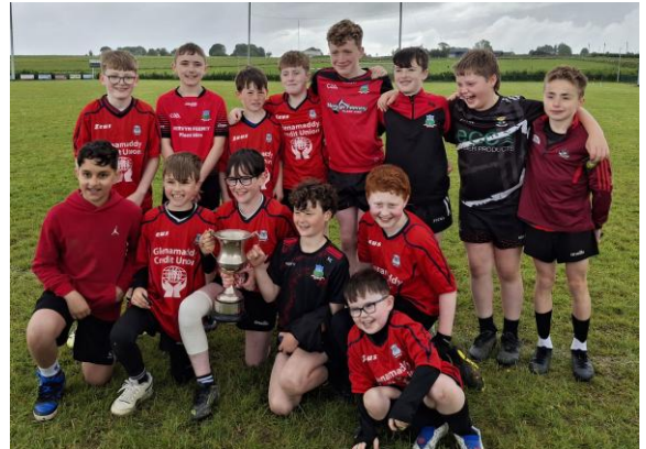
Winners – Tom Lohan Cup