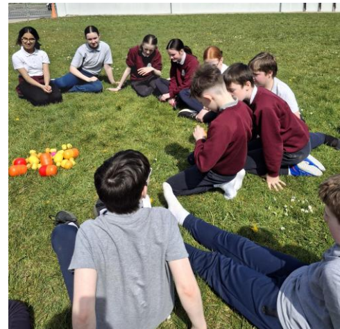
Say Yes to Language Programme

Glinsk N.S. Phone - (094) 965257 E-mail address: glinkschool@gmail.com