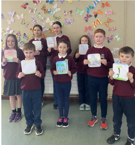
Green Schools Habitat Hero art winners