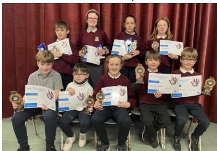
Credit Union Art prize winners