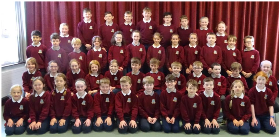
Peace Proms 2023 Choir