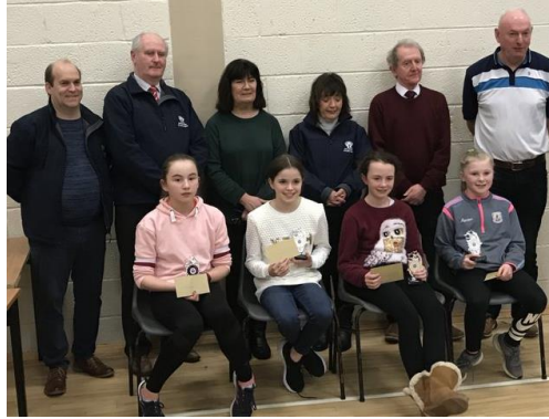
Good luck to the U13 Team

Good luck & best wishes to the U13 team taking part in the CUDA [Credit Union Development Association] quiz on Saturday 7th of March at the Crowne Plaza Hotel, Blanchardstown, Dublin. Go n-eirí libh.