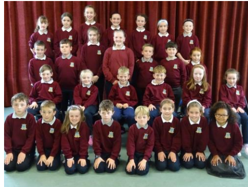
Peace Proms 2020 Choir