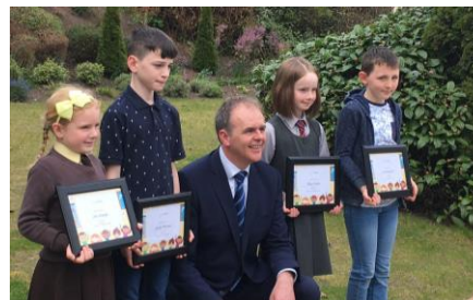
C.P.S.M.A. Art presentations