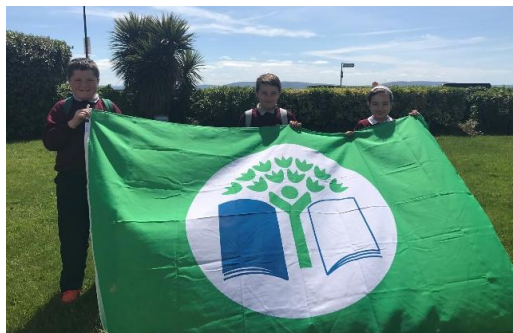
Green Schools Committee Members receive our Green Flag

Members of the Green Schools committee attended the An Táisce Green Schools award day in Galway to receive the school's green flag for energy. Well done to all the Green Schools committee for all their work in achieving this flag.