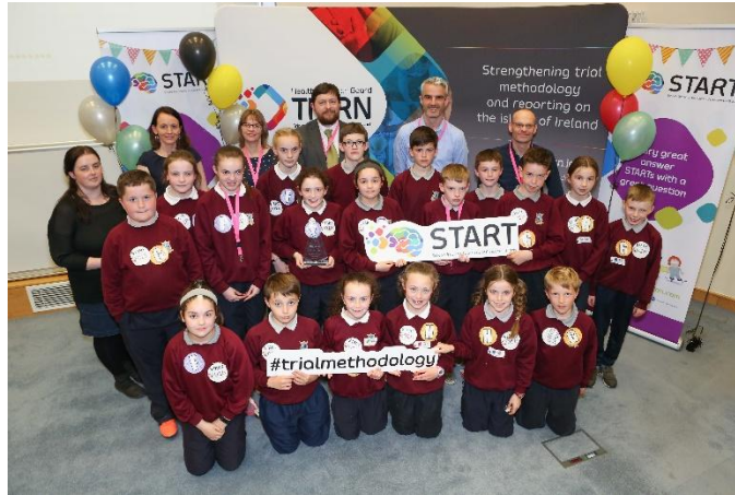
Glinsk N.S. pupils receive their START award at N.U.I.G.