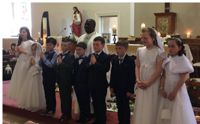
First Holy Communion Class

Congratulations to 6th class pupils who received the sacrament of confirmation and 2nd class pupils who received the sacrament of First Holy Communion recently in St. Michael's church. Thank you to everyone who helped out in so many different ways with preparations for both occasions, team leaders on the You Shall be My Witnesses programme for confirmation and parental participation in the Do this in Memory of me programme, the adult and junior choirs, mass servers and sacristan, parish secretary, the altar society, the parish council and all who had the church grounds looking so well. Sincere thanks to all who helped to prepare mass booklets for the ceremony of light & the confirmation ceremony, prepare the altar display with the tree of life & symbols with such care and attention to detail. A special thanks to all who gave generously of their time to prepare refreshments on the evening of the ceremony of light, after confirmation ceremony and on the morning of First Holy Communion and all who donated home-baking ensuring all families from other schools and our own parish received a warm welcome. We appreciate the work of the R.S.S. team who painted around the school and the lovely window boxes all in preparation for these special occasions. Thank you all.