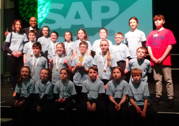
Glinsk N.S. receive their Rising Star Award