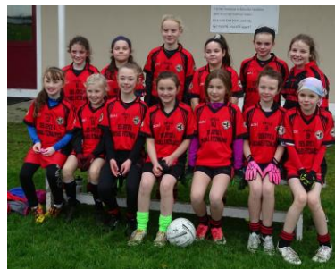
Cumann na mBunscol Mini 7's Area Winners