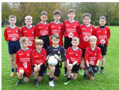
Cumann na mBunscol Mini 7's Area Finalists

Congratulations to both the boys and girls football teams on their great performances in the Cumann na mBunscol Gaelic Mini 7's competition. The boys reached the area final competition and the girls went on to the county final following their area final win, a great achievement for a second consecutive year.